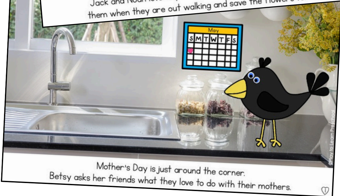
Mother's Day is just around the corner. Betsy asks her friends what they love to do with their mothers.