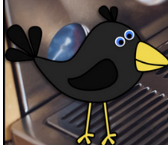
Betsy watched the barista make the drinks.